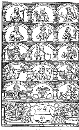
Figure 3b. Emblematic depiction of the 14 arts, from Bartholomeus Chasseuneux: Catalogus gloriae mundi, Lugdunum 1529 (note medicine in the middle of second row) (repr. from Lindgren 1992, p. 67).