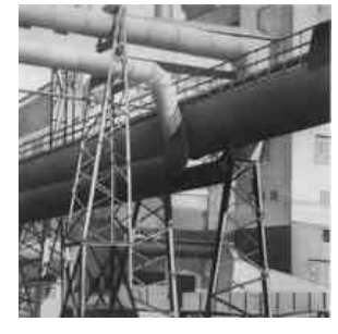
(c) Charles Sheeler, Ballet Mechanique (1931) (Troyen 1987, p. 125), permission of Memorial Art Gallery, University of Rochester.

Like the work of the machine purists, close-up images of chemical plants appear representational but in fact rely heavily on the formal canon of abstract art, including an emphasis on primary geometric forms juxtaposed into complex arrays akin to the work of the cubists. In theory, the geometric nature of these images reflects the order and rationality of the machines they