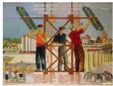
Figure 16 a) Konstantin Vyalov, Let's consolidate the victory of socialism in the USSR!, 1932

the fear or amazement that its accomplishment inspires" (Nicoldon 1968, p. 50). It also, however, reveals the darker side of the picturesque in which the working classes were aestheticized for the consumption of the affluent. In 19<sup>th</sup>-century realist paintings, such as Adolf von Menzel's Iron Rolling Mill , this idealized view of industrial work is superseded by interiors of industrial plants that are overcrowded with workers, replete with machinery, and overheated by steam and fire (Figure 15b). In the early 20<sup>th</sup> century depictions of industrial workers became more overtly politicized emblems of the socialist (and national-socialist) movements in many countries. As seen in the soviet era propaganda poster Let's consolidate the victory of socialism in the USSR! (Figure 16) such images accorded the workers with even more blatant heroic status than those of the 18<sup>th</sup> and 19<sup>th</sup> centuries.