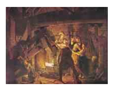
Figure 15 a) Joseph Wright of Derby, An Iron Forge (1772) (repr. from Daniels 1999, p. 52)

A varied representation of industry can also be found in images of workers in industrial settings (Figure 15). In many paintings of this genre the workers are rendered as heroic and hard-working and it is the representation of their surroundings that expresses the artists' attitude toward industry itself. A typical early example is Joseph Wright's An Iron Forge (Figure 15a).