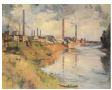
Figure 14. Arthur Henry Knighton-Hammond, Looking Down the Tittabawassee River at the Dow Chemical Plant (1920) (repr. from Frese 2000, p. vi), permission of The Hebert H. and Grace A. Dow Foundation.

rally these paintings provided a positive, and suitably unthreatening, image of the industries they depicted. For these, unlike earlier images of industry such as Coalbrookdale at Night , therefore, we can unambiguously read the smoke coming out of the chimneys as a symbol of economic productivity and wealth rather than as a noxious indicator of industrial pollution (Figure 14).