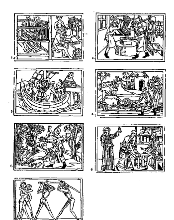
Figure 3a. Emblematic depiction of the seven mechanical arts after Hugo de St. Viktor; from Rodericus Zamorensis, Spiegel des menschlichen Lebens , Augsburg 1475 (note medicine no. 6) (repr. from Lindgren 1992, p. 71)

late antique motif of the medicine vessel described above. Only the third one (Figure 2c) presents the posture that later became stereotypical for medicine and much later for chemistry: the flask held at the neck and raised high in front of the eyes. Unlike the two medical manuscript illustrations (Figures 2a and b) this relief, which was publicly placed among Giotto's/Pisano's famous emblematic representations of the liberal arts at the Campanile of the Cathedral of Florence, was clearly intended to be a popular emblematic representation of medicine.<sup>4</sup>