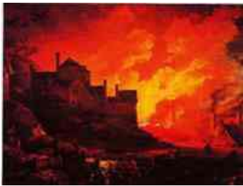
Figure 13. a) Philippe Jacques de Loutherbourg, Coalbrookdale at Night (1801) (repr. from Frese 2000, p. 3)

Since the 18<sup>th</sup>-century period of industrialization, artists' renderings of industry began to express a conflicted reaction to industry in the larger culture, a response that is at once celebratory and admiring and a site of distain and distrust.<sup>12</sup> During the British romantic period these responses were expressed through renderings of the industry within the tradition of the picturesque or sublime landscape painting. A prototypically sublime rendition of industry is famously captured in Philippe Jacques de Loutherbourg's 1801 painting Coalbrookdale by Night (Figure 13a).