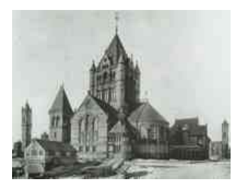
Figure 18. Examples of early architectural b) A. A. Turner, Font Hill Castle (1860) (repr. photographs of castle and cathedral, a) from Robinson 1987, p. 22) Anonymous, Boston Trinity Church (1876) (repr. from Robinson 1987, p. 5)

symbolic aegis that cathedrals and castles historically sustained. In effect, these photographs invite a symbolic exchange in which the industrial site can stand in for the signs of governance and social order historically signified by castle and church.