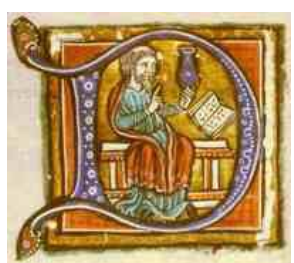
Figure 2a. Illustration from Hunayn ibn Ishaq al-'Ibadi, 809?-873 (known as Joannitius). Isagoge Johannitii in Tegni Galeni. (called Articella), Oxford, 13th century ms (DeRicci NLM [78], Fol. 42v, National Library of Medicine).